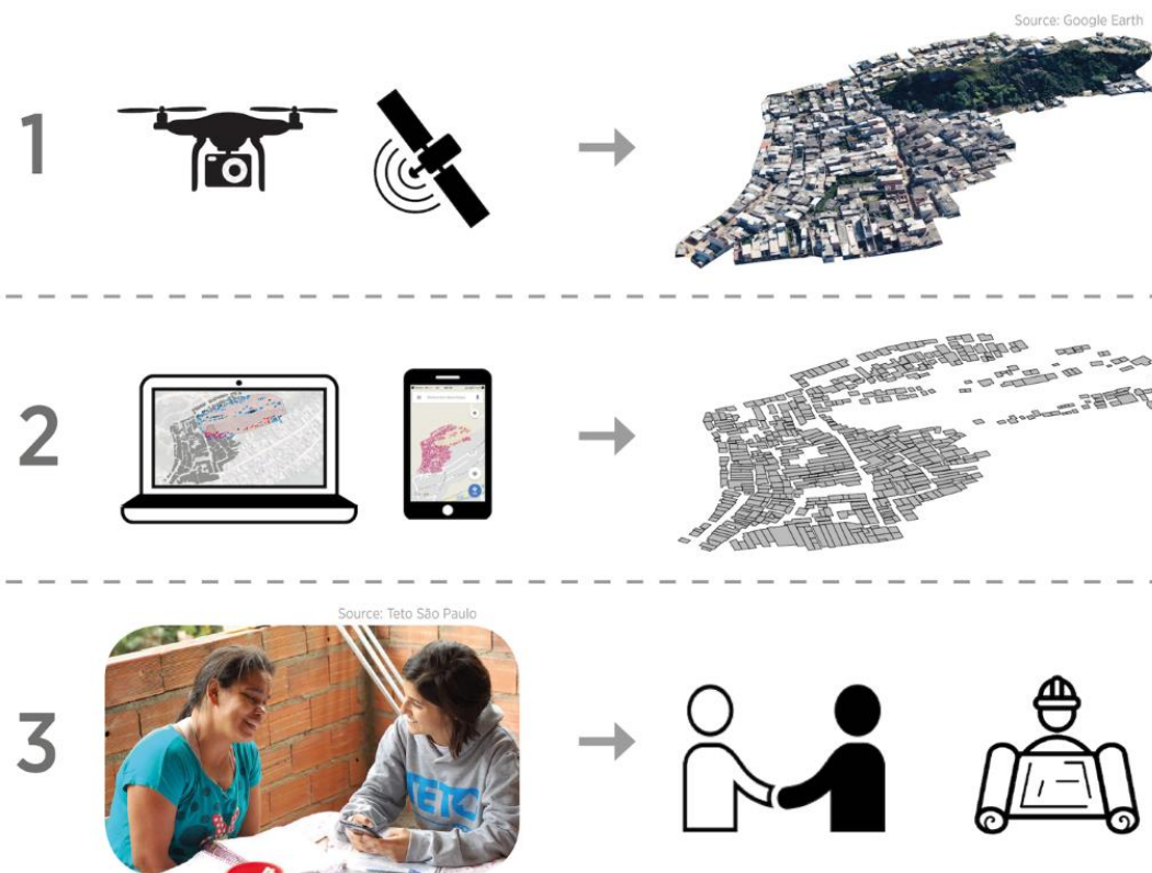
Figure 2: Teto's mapping process, step-by-step: (1) acquiring drone or satellite imagery; (2) digitizing building footprints, with on-site verifications using Google My Maps; (3) validating GI data to obtain geographic information that may support upgrading projects. Elaborated by the authors, based on Google Earth (2018) and Pessoa Colombo (2019).

At the end of each mapping campaign, Teto and community leaders organise focus groups that validate and interpret the collected data through a horizontal dialogue with the community (Santos Melo et al. 2021). Community leaders use printed maps to situate geographically specific demands. This way, they turn geographic data into information, which they use to plan future interventions. They use large, printed maps (e.g., in ISO A0 format) in these discussions that allow more spontaneous annotations (Figure 3). Such discussions based on printed materials are crucial to overcoming technological and material barriers to participation in geographic information. In this way, local knowledge enhances geographic data. This process also allows the co-development of community projects between the NGO and the inhabitants.