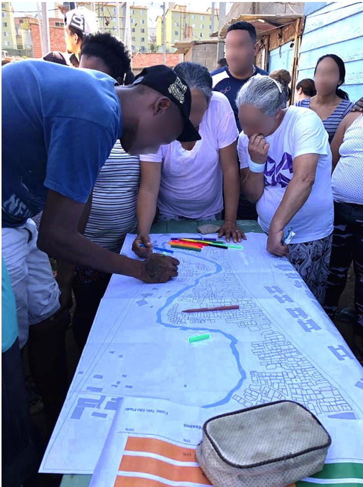
Figure 3: Focus group co-organized by Teto and local community leaders to enhance geographic information.