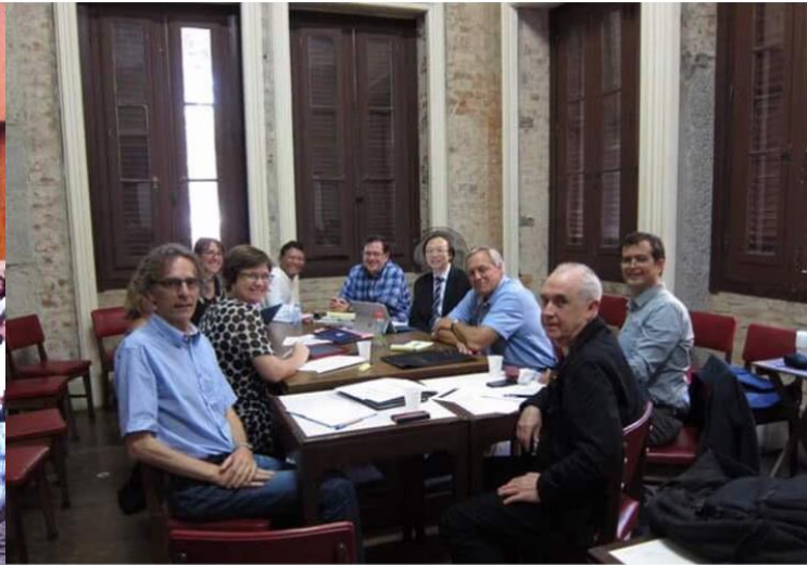
World Planning School Congress in Brazil 2016