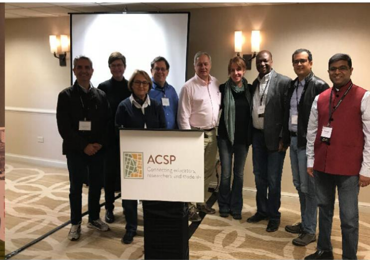
GPEAN 2017 Meeting in Denver