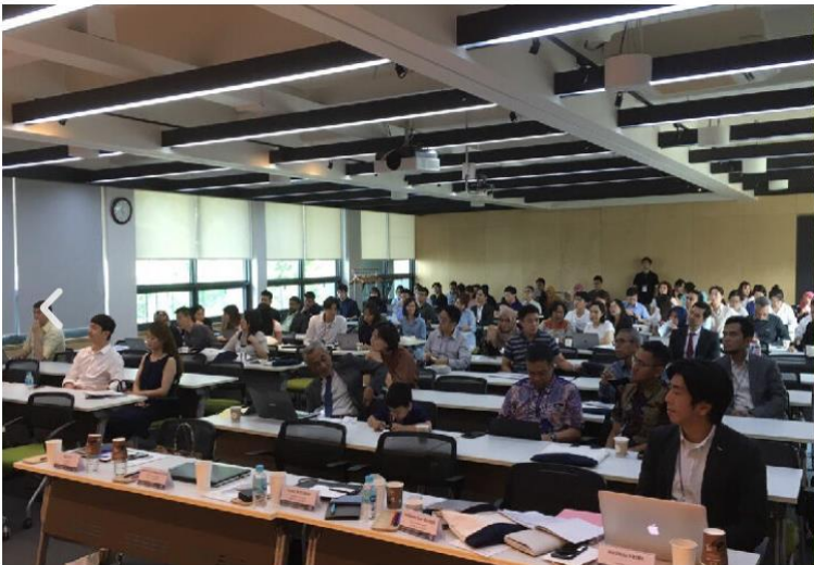
15th APSA Congress in South Korea