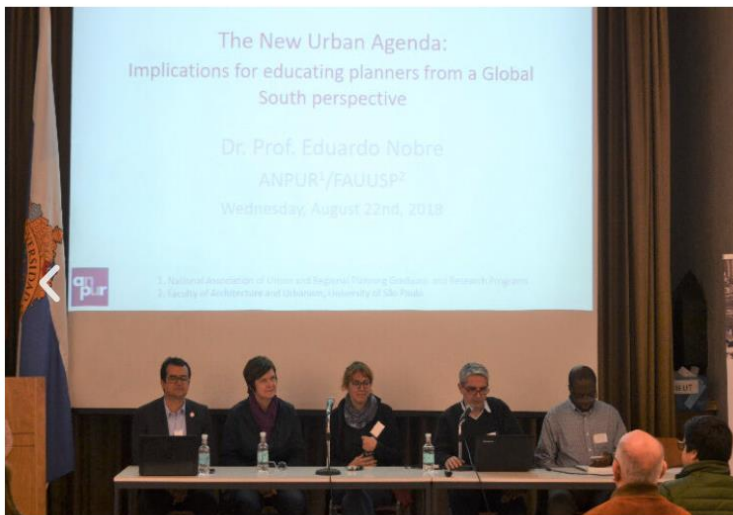
GPEAN 2018 Meeting in Santiago de Chile

Bring together planning education actors, professionals, from all continents through hybrid platform and encouraging debates, sharing experiences and solutions that may contribute to a more diverse planning education in the future through various programs.