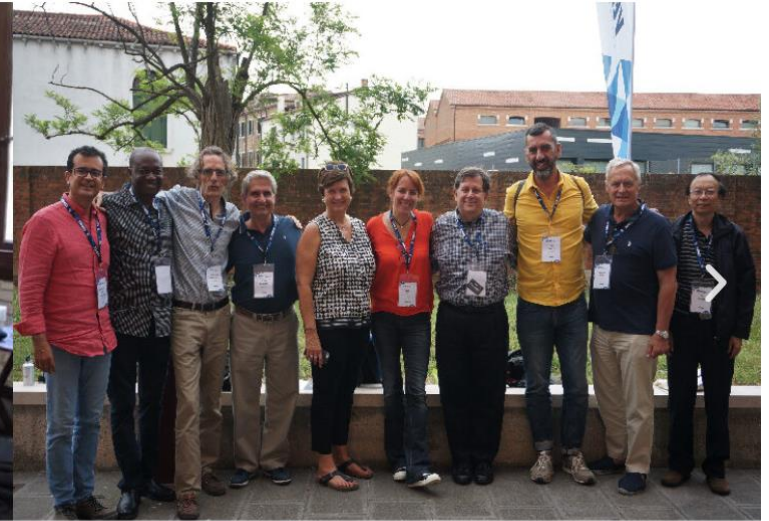
GPEAN 2019 Meeting in Venice