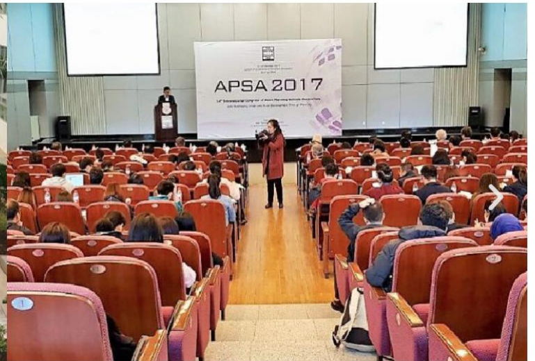
14th APSA Congress in Beijing