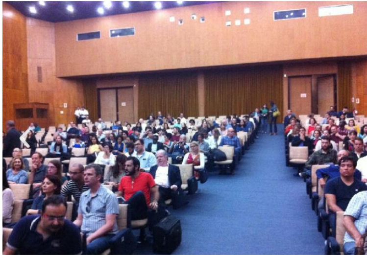
World Planning School Congress in Brazil 2016