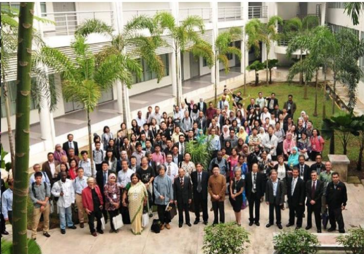
13th APSA Congress in Malaysia