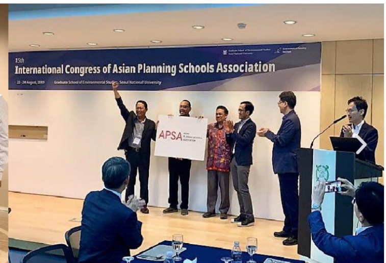
15th APSA Congress in South Korea